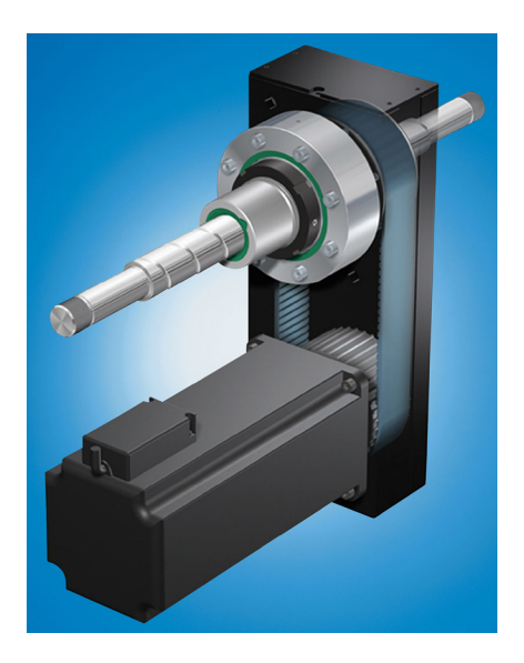
Self-driven nut products like Rexroth's FAR Rotating Nut can achieve precision ratings rivaling those of linear motors, even with long strokes.

Besides the internal ball screws and guides, however, the housing design itself is crucial when it comes to accuracy and precision. The most widely used housing material is extruded aluminum because it allows longer continuous lengths. With aluminum extrusion modules, the mounting surface or number of supports will have the most significant