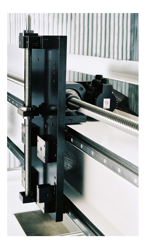
Accuracy in linear guides depends on many factors, including the trueness of the rail on which the runner block travels.

In summary, machine designers working on highly accurate systems must incorporate precise electronic systems. But equal billing should be given to the mechanical components as well. Factors such as component sizing, linear guide and bearing design, ball screw and nut options, and linear module housing material are just as critical in providing the best accuracy possible in your machine. Considering these items early in the design will help ensure your mechanical elements work as smoothly as possible with your motion controller to provide the precision your application demands.