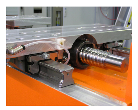
Ball screw and rail combinations like this provide a good balance of travel accuracy and load carrying capability, even with axial or torsional loading.

Applications at the very high end of the accuracy spectrum, such as gaging, coordinate measuring machines, microelectronics-even super high-end metal cuttingcan be adversely affected by even minute movement of the balls in the recirculation chamber, or by just a slight pivoting of the rail system about its axis. Any deflection or clearance at all reduces accuracy, and any roughness in the recirculation of the balls can cause inaccuracy in the machine output, even when coupled with highly sophisticated motion controllers. Non-recirculating linear systems such as cross roller slides or air bearings often allow only a limited stroke or require complex air supply systems and extremely heavy polished granite support systems. Considerable cost could be eliminated